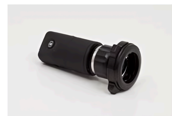
IMAGE AND VIDEO CAPTURE

DE1270 empowers healthcare professionals with a whole new perspective. Its advanced technology can quickly provide a high-definition image for quick and accurate diagnosis.